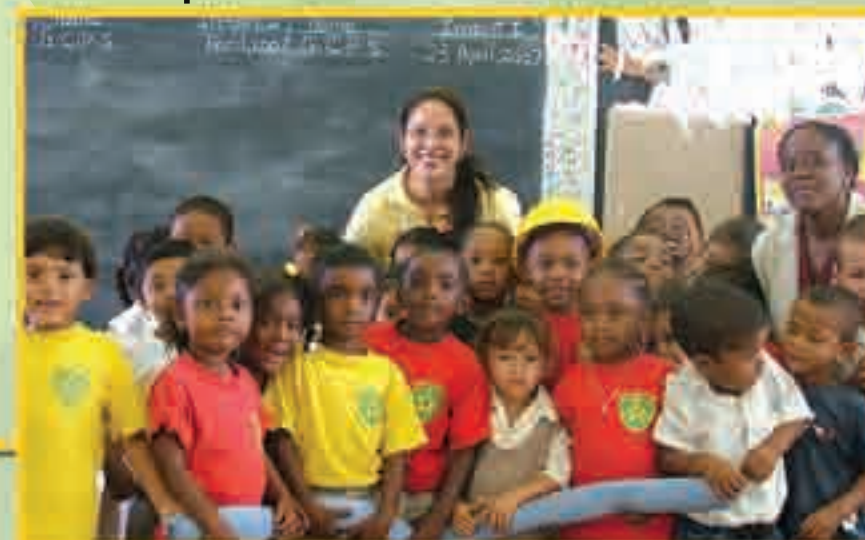
Presentation on "Oil in Belize" at Garden City Primary School

Since the discovery of crude oil in commercial quantities, BNE has endeavored to educate the public about the nuances and peculiarities of this new industry. Since the end of 2006, BNE has been constantly inserting important industry related information into the nation's newspapers (Crude Facts), presentations have been made to schools and organizations and a documentary and website have been developed.