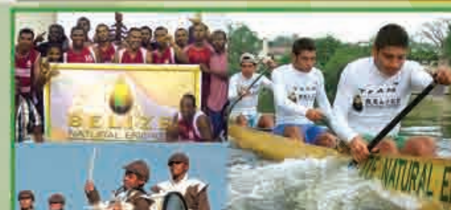
BNE has sponsored a variety of sports including Semi-pro Basketball, La Ruta Maya and Bandfest 200