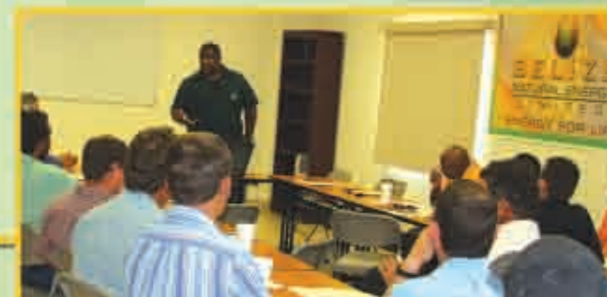
Meeting with buyers of crude oil to discuss appropriate handling of the product